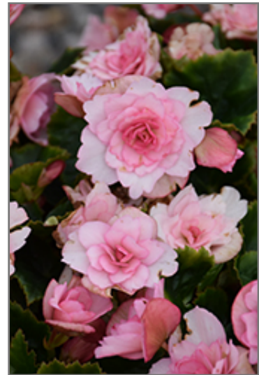
Glory Pink Begonia flowers

This compact, rounded variety produces dense, deep green foliage; stunning pink double blooms with butter yellow centers; a great choice for light shade gardens or containers