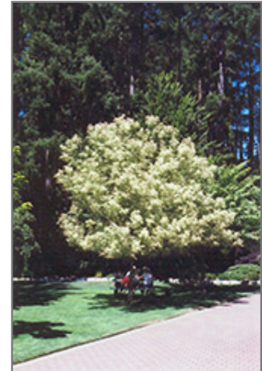
Flamingo Boxelder