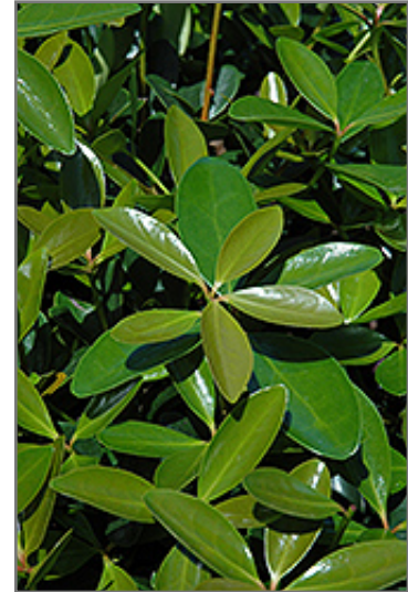
Bigfoot Cleyera foliage