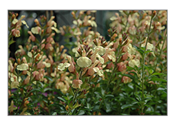
Golden Girl Sage flowers