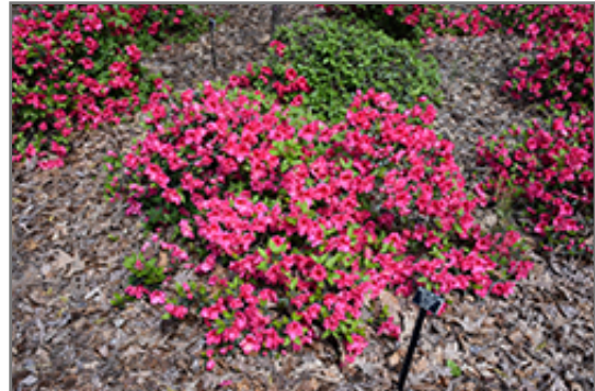
Red Ruffles Azalea in bloom