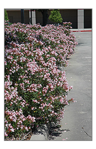
Petite Pink Oleander in bloom

This shrub does best in full sun to partial shade. It is very adaptable to both dry and moist locations, and should do just fine under average home landscape conditions. It is considered to be drought-tolerant, and thus makes an ideal choice for xeriscaping or the moisture-conserving landscape. It is not particular as to soil pH, but grows best in poor soils, and is able to handle environmental salt. It is highly tolerant of urban pollution and will even thrive in inner city environments. This is a selected variety of a species not originally from North America, and parts of it are known to be toxic to humans and animals, so care should be exercised in planting it around children and pets.