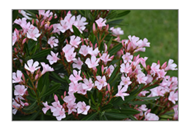
Petite Pink Oleander flowers

Petite Pink Oleander is recommended for the following landscape applications;