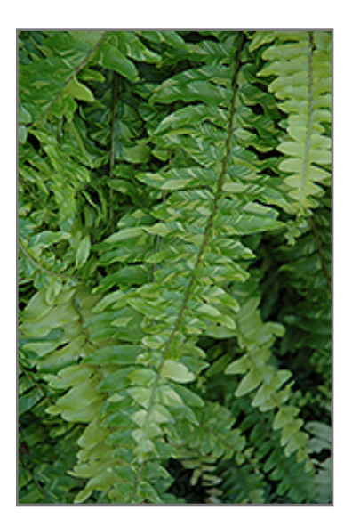
Variegated Boston Fern foliage