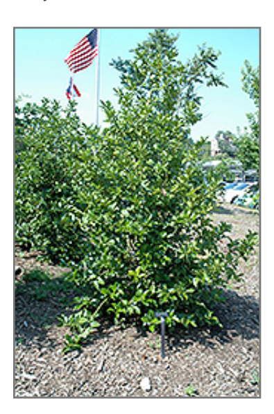
Wirt L. Winn Holly