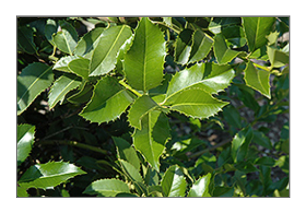
Wirt L. Winn Holly foliage