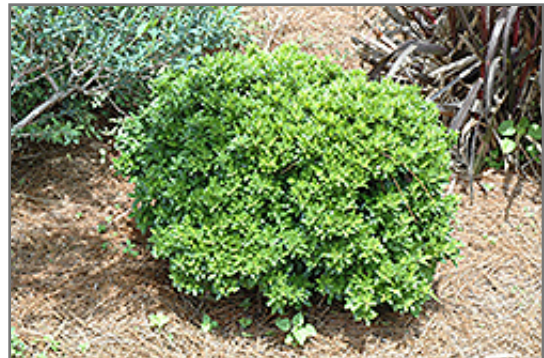
Oscar's Dwarf Yaupon Holly