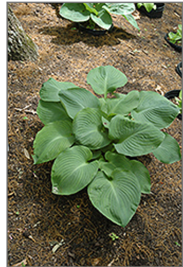
Mississippi Delta Hosta

A very large, upright clump of blue-green to dark green rounded foliage that has slightly wavy margins; near-white flowers on arching stems in mid-summer; perfect for shade and woodland gardens