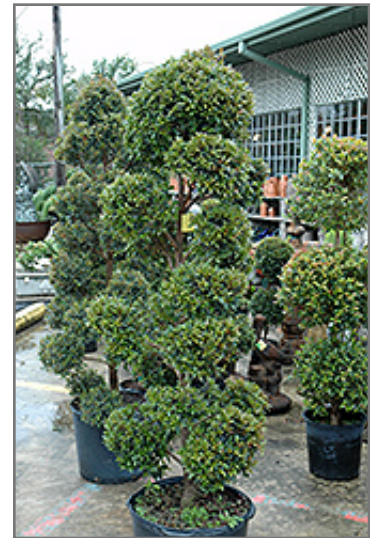
Brush Cherry