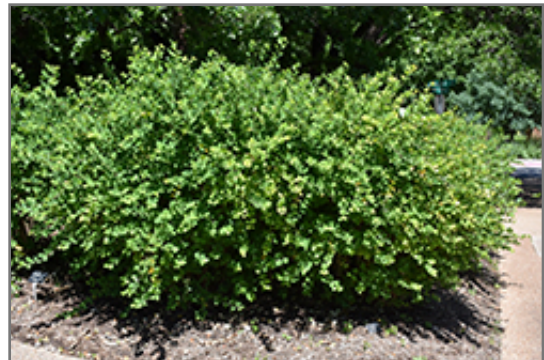
Winter Honeysuckle