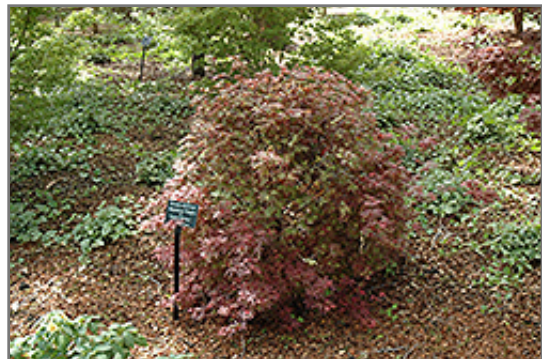
Kandy Kitchen Japanese Maple