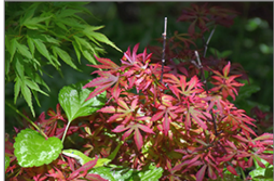
Kandy Kitchen Japanese Maple foliage