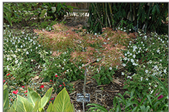
Chantilly Lace Japanese Maple