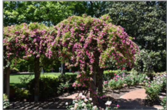
Climbing Pinkie Rose flowers