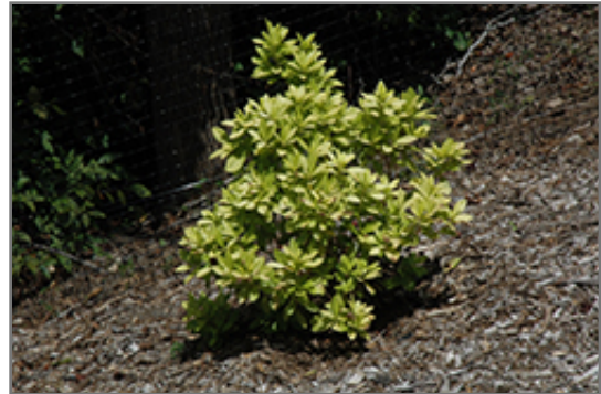
Florida Sunshine Anise