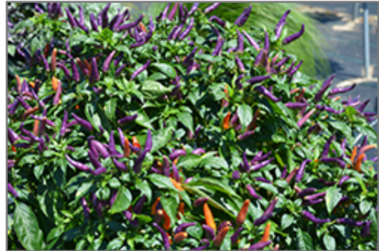
Sangria Ornamental Pepper fruit