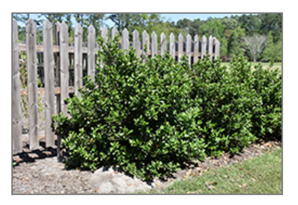
Sandanqua Viburnum

Sandanqua Viburnum is recommended for the following landscape applications;