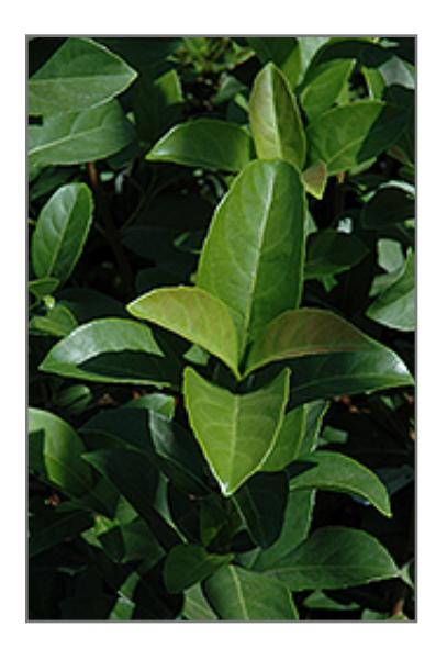
Sandanqua Viburnum foliage

8546 Sun Valley Road Anytown, USA 12345 204.782.4147