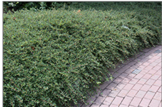
Coral Beauty Cotoneaster