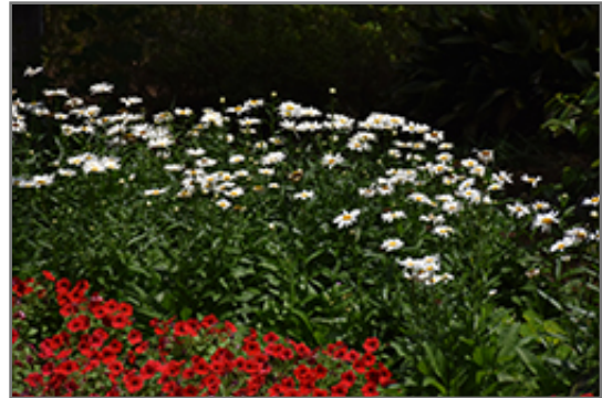
Brightside Shasta Daisy in bloom