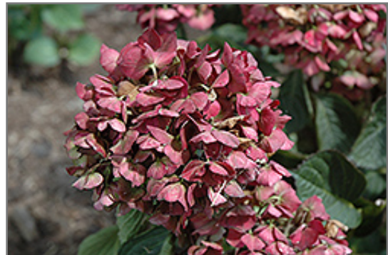
Magical Ruby Red Hydrangea flowers

Magical Ruby Red Hydrangea will grow to be about 4 feet tall at maturity, with a spread of 4 feet. It tends to fill out right to the ground and therefore doesn't necessarily require facer plants in front. It grows at a fast rate, and under ideal conditions can be expected to live for approximately 20 years.