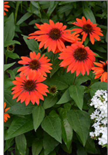
Sombbrero Flamenco Orange Coneflower in bloom

Sombbrero Flamenco Orange Coneflower is recommended for the following landscape applications;