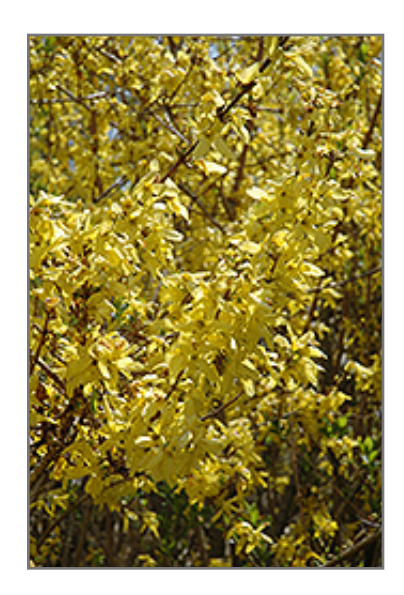
Spring Glory Forsythia flowers

8546 Sun Valley Road Anytown, USA 12345 204.782.4147