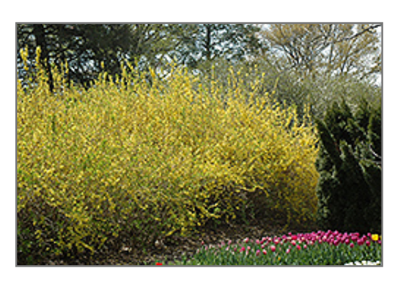
Spring Glory Forsythia in bloom

Spring Glory Forsythia is recommended for the following landscape applications;