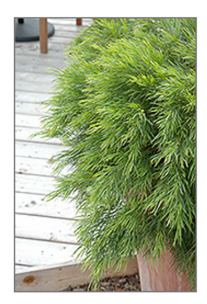
Cousin Itt Little River Wattle foliage