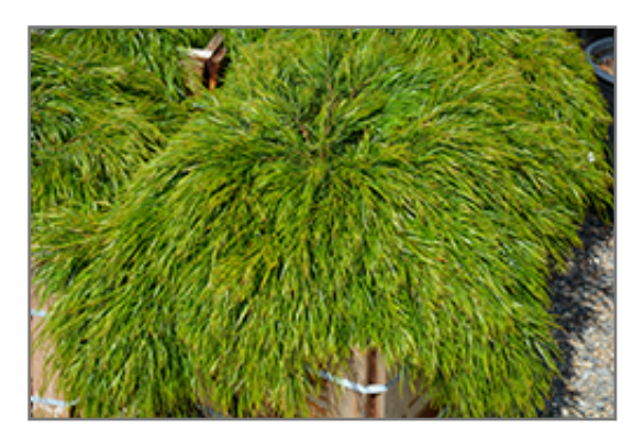
Cousin Itt Little River Wattle

This is a relatively low maintenance shrub, and should only be pruned after flowering to avoid removing any of the current season's flowers. Gardeners should be aware of the following characteristic(s) that may warrant special consideration;