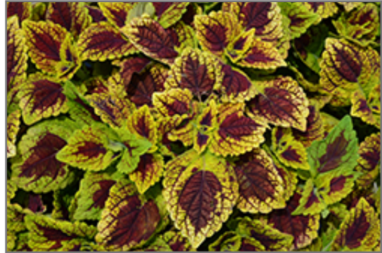
Stained Glassworks Raspberry Tart Coleus foliage