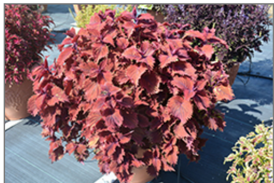
Under The Sea King Crab Coleus