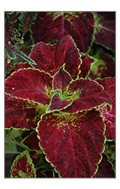
ColorBlaze Dipt in Wine Coleus foliage

ColorBlaze Dipt in Wine Coleus will grow to be about 24 inches tall at maturity, with a spread of 14 inches. When grown in masses or used as a bedding plant, individual plants should be spaced approximately 12 inches apart. Although it's not a true annual, this fast-growing plant can be expected to behave as an annual in our climate if left outdoors over the winter, usually needing replacement the following year. As such, gardeners should take into consideration that it will perform differently than it would in its native habitat.