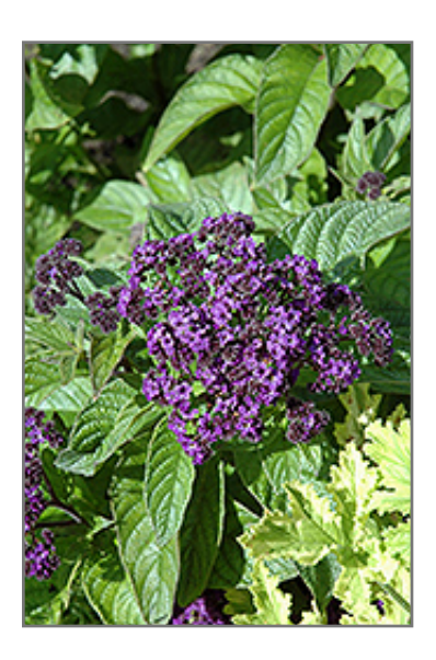
Marine Heliotrope flowers