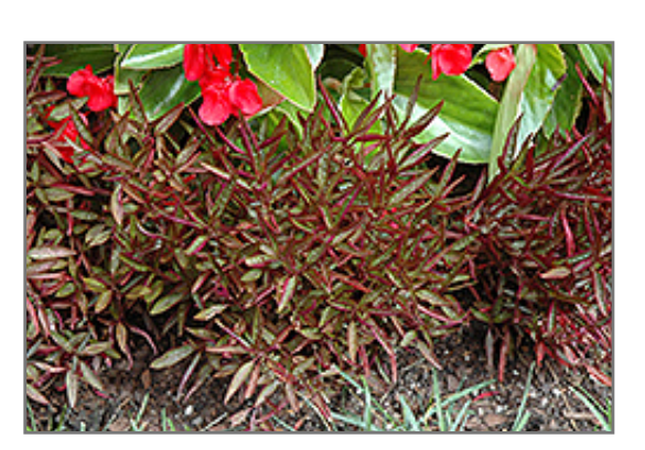
Burgundy Threadleaf Alternanthera foliage

Burgundy Threadleaf Alternanthera will grow to be about 12 inches tall at maturity, with a spread of 12 inches. Although it's not a true annual, this fast-growing plant can be expected to behave as an annual in our climate if left outdoors over the winter, usually needing replacement the following year. As such, gardeners should take into consideration that it will perform differently than it would in its native habitat.