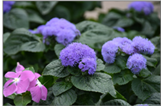
High Tide Blue Flossflower flowers