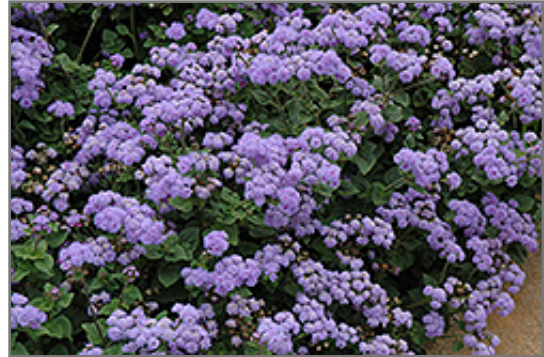
High Tide Blue Flossflower in bloom

High Tide Blue Flossflower is a fine choice for the garden, but it is also a good selection for planting in outdoor containers and hanging baskets. It is often used as a 'filler' in the 'spiller-thriller-filler' container combination, providing a mass of flowers against which the thriller plants stand out. Note that when growing plants in outdoor containers and baskets, they may require more frequent waterings than they would in the yard or garden.