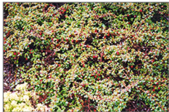
Streib's Findling Cotoneaster fruit