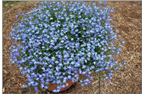
Bella Cielo Lobelia in bloom