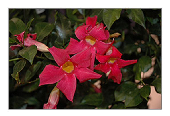
Sun Parasol Pretty Deep Pink Mandevilla flowers

This tropical plant does best in full sun to partial shade. It requires an evenly moist well-drained soil for optimal growth. It may require supplemental watering during periods of drought or extended heat. It is not particular as to soil type or pH. It is highly tolerant of urban pollution and will even thrive in inner city environments. This particular variety is an interspecific hybrid, and parts of it are known to be toxic to humans and animals, so care should be exercised in planting it around children and pets. It can be propagated by cuttings; however, as a cultivated variety, be aware that it may be subject to certain restrictions or prohibitions on propagation.