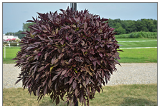
Illusion Garnet Lace Sweet Potato Vine