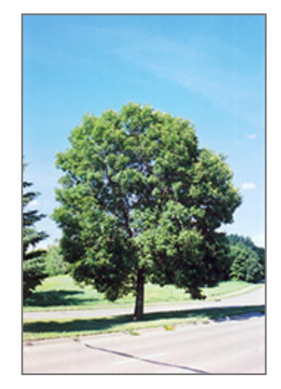
Green Ash