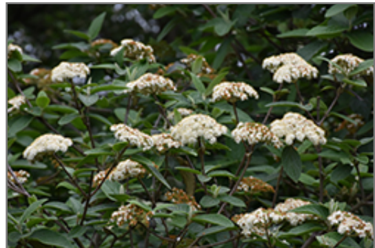
Alleghany Viburnum flowers

Alleghany Viburnum is recommended for the following landscape applications;