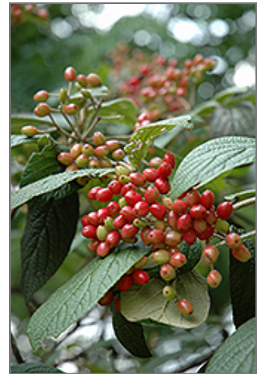
Alleghany Viburnum fruit

This shrub does best in full sun to partial shade. It prefers to grow in average to moist conditions, and shouldn't be allowed to dry out. It may require supplemental watering during periods of drought or extended heat. It is not particular as to soil type or pH. It is highly tolerant of urban pollution and will even thrive in inner city environments. This particular variety is an interspecific hybrid.