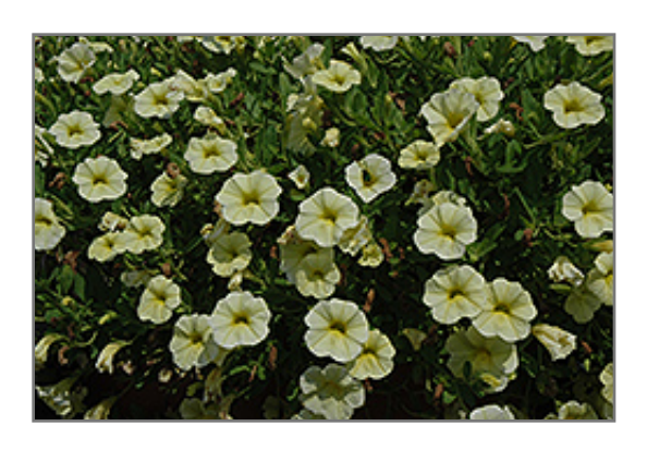
MiniFamous iGeneration Lemon Calibrachoa flowers