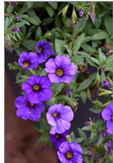
Aloha Kona Midnight Blue Calibrachoa flowers

Aloha Kona Midnight Blue Calibrachoa is recommended for the following landscape applications;