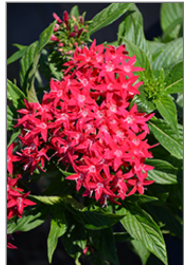
Graffiti OG Lipstick Star Flower flowers

Graffiti OG Lipstick Star Flower is recommended for the following landscape applications;