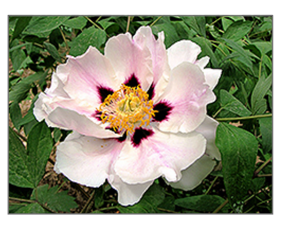
Zi Ban Fen Tree Peony flowers