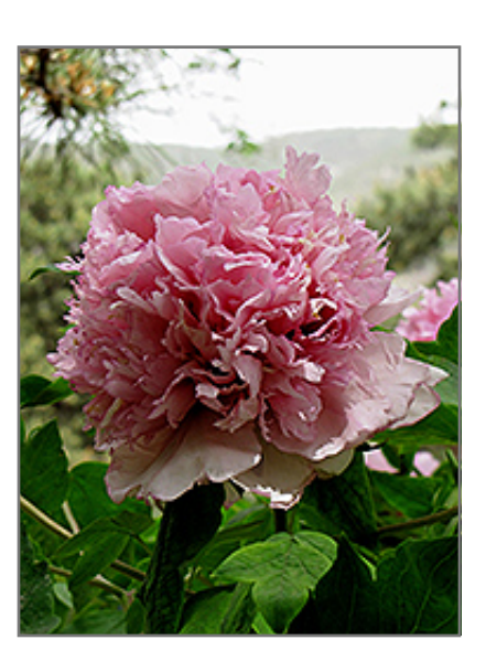
Fen Yu Sheng Hui Tree Peony flowers