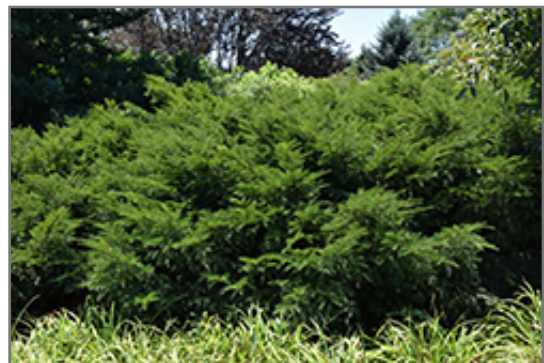
Runyan Yew