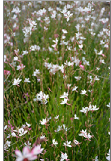
Ballerina White Gaura in bloom