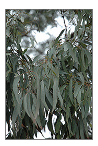
Tasmanian Blue Gum foliage