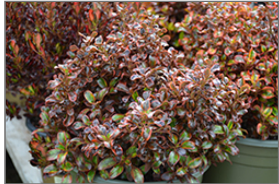
Tequila Sunrise Mirror Bush