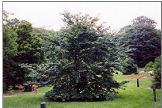
American Beech