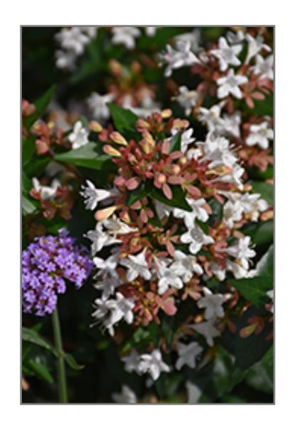
Ruby Anniversary Abelia flowers