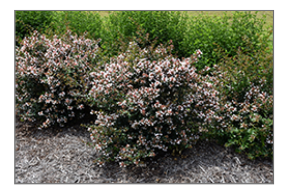
Ruby Anniversary Abelia in bloom