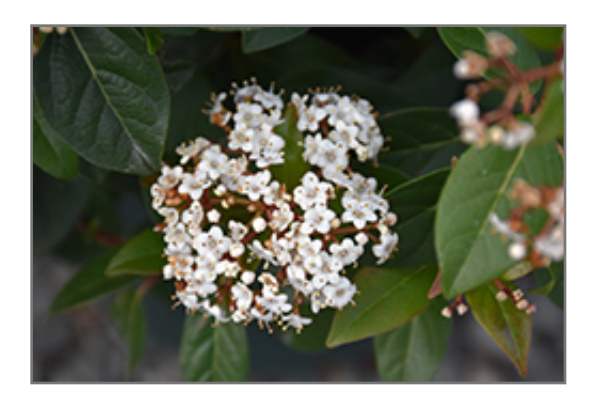
Spirit Laurustinus flowers

This is a relatively low maintenance shrub, and should only be pruned after flowering to avoid removing any of the current season's flowers. It is a good choice for attracting birds to your yard, but is not particularly attractive to deer who tend to leave it alone in favor of tastier treats. It has no significant negative characteristics.