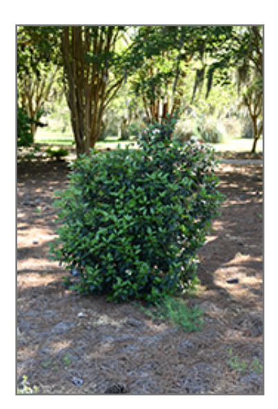
Spirit Laurustinus

8546 Sun Valley Road Anytown, USA 12345 204.782.4147