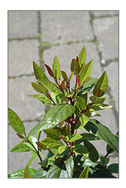
Spirit Laurustinus foliage

This shrub does best in full sun to partial shade. It is very adaptable to both dry and moist locations, and should do just fine under average home landscape conditions. It may require supplemental watering during periods of drought or extended heat. It is not particular as to soil type or pH, and is able to handle environmental salt. It is highly tolerant of urban pollution and will even thrive in inner city environments. This is a selected variety of a species not originally from North America.