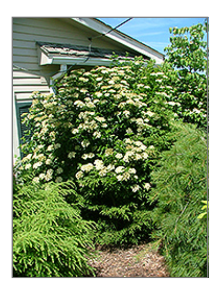
Fireworks Viburnum in bloom

8546 Sun Valley Road Anytown, USA 12345 204.782.4147