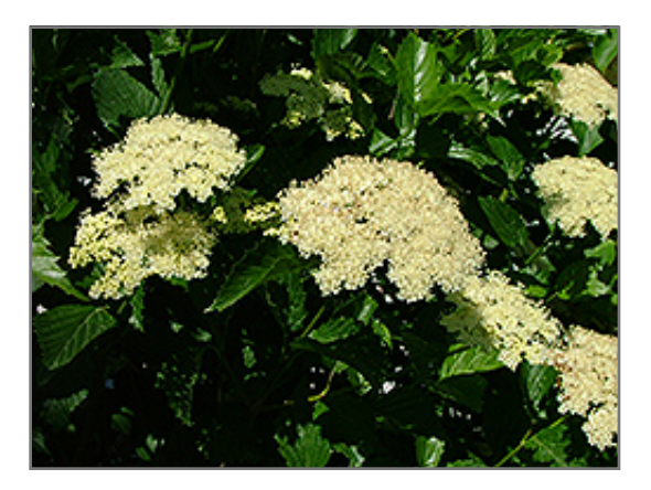
Fireworks Viburnum flowers