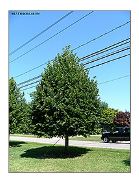
Silver Dollars Linden

This is a relatively low maintenance tree, and is best pruned in late winter once the threat of extreme cold has passed. It is a good choice for attracting bees to your yard. Gardeners should be aware of the following characteristic(s) that may warrant special consideration;